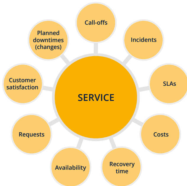
The 360° view of the service

— Only very few IT organizations can evaluate ITSM data across all platforms. To enable service-oriented controlling of your IT, however, you need all the relevant data on your IT services, such as service availability, number of incidents, service costs, data on customer satisfaction, SLA violations, etc., in a central view. As a result you can always keep an eye on performance-critical KPIs for IT service and how they change – regardless of where the data comes from, such as the monitoring system, the last customer satisfaction survey, the ticket/incident management system or IT cost allocation.